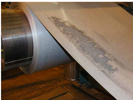
Heavy oxidation between coil wraps.