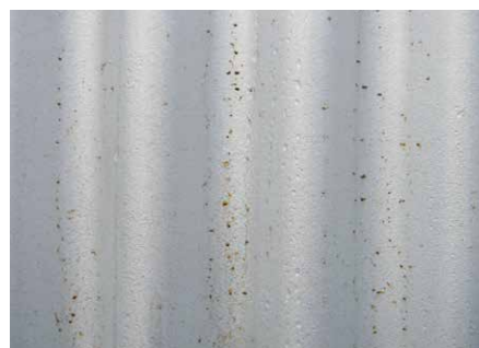
Moderate swarf staining on ZINCALUME Plus.

The information and advice contained in this Technical Bulletin ("Bulletin") is of a general nature only and has not been prepared with your specific needs in mind. You should always obtain specialist advice to ensure that the materials, approach and techniques referred to in this Bulletin meet your specific requirements.