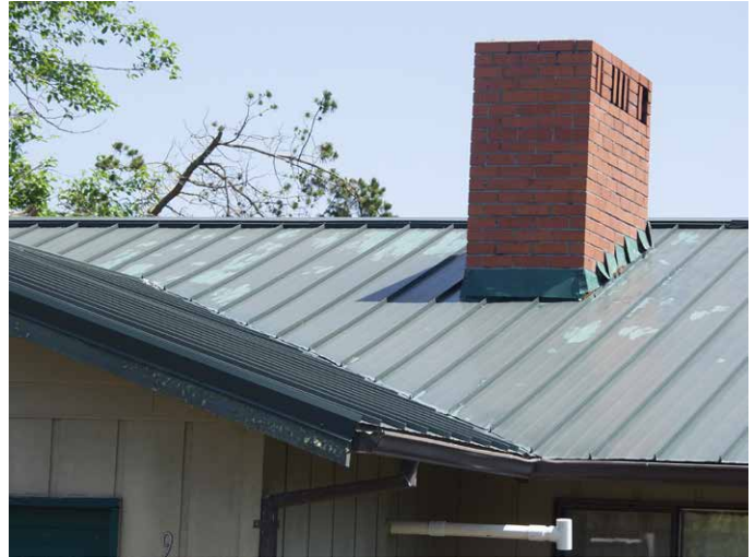
Excessive use of touch-up paint that has faded faster than factory applied coating.

Special attention should be paid to the manufacturer’s instructions, including direct skin or eye contact, ventilation and potential flammability. Aerosol or spray applications are not recommended for blemish or scratch repairs. The best tool for this type of repair is a good quality, 1/4 in. artist brush or a pen tip type applicator; only the narrow edge of the applicator should actually contact the scratch or blemish. Use touch-up paint sparingly and only to cover up those areas where paint has been removed. Excessive use of touch-up paint will result in a blotchy, uneven, appearance (see picture).