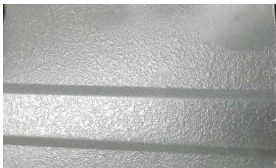
Storage corrosion under the paint on formed, nested panels.