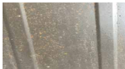
Heavy swarf staining on pre-painted ZINCALUME.

Note: The above repair actions will not fully restore the product to its original state. It is critical to ensure that swarf is avoided.