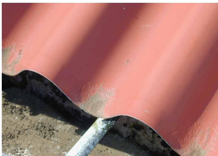
Silt accumulation on a panel without a drip edge. Blistering of the paint is an early sign of corrosion.

Profiles with a hemmed drip edge allow water and debris to flow off the panel, thus providing better long-term corrosion performance.