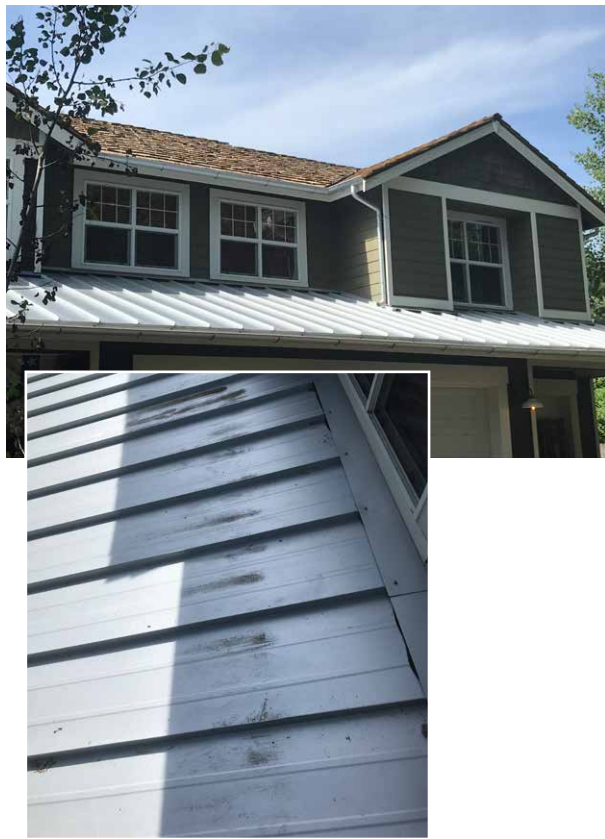
Copper treated shingles above bare ZINCALUME roof panels, the water runoff resulted in black oxidation.

The information and advice contained in this Technical Bulletin ("Bulletin") is of a general nature only and has not been prepared with your specific needs in mind. You should always obtain specialist advice to ensure that the materials, approach and techniques referred to in this Bulletin meet your specific requirements.