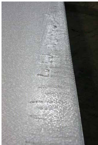
Light corrosion on stacked flatsheets.

Other sources of oxidation could evolve during processing of the ZINCALUME Steel itself. Inadequately cured surface treatments or water-based remnants of forming lubricants allowed to remain on the surface during storage will provide entrapped moisture for oxide formation. The net effect would be a dark oxidation stain (rust) with a linear and blotchy pattern not necessarily associated with the edges.