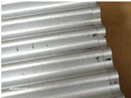
Transit abrasion on formed panels.

ZINCALUME Plus Steel resists marking and stains occurring during manufacturing, handling or fixing. The coating acts as a surface sealant, protecting the metal surface from hand and boot prints. CAUTION - during transportation of coil, sheets or formed panels, galling or abrasion of the resin coating can occur when one resin surface vibrates, or rubs, excessively against another resin surface. It will present as black marks, which are often mistaken for black rust, but it is not rust. Galling of the resin surface is strictly aesthetic in nature; the long-term performance of the product is unaffected.