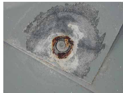
Over driven fastener resulting in premature corrosion of the ZINCALUME panel.