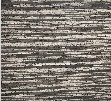
Matte Barnwood XWOOBG20