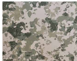
Marshland CAMO SRI 53 • XGRAMC02