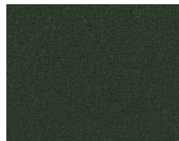
Hartford SRI 23 • 20532