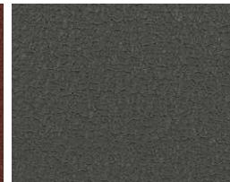
Ash Gray SRI 31 • 17878