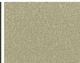
Hickory SRI 49 • 20533