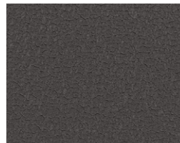
Steel Gray SRI 26 • 19914