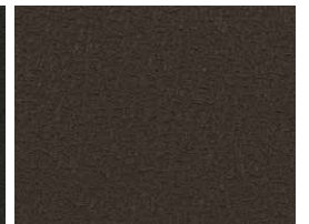
Dark Walnut SRI 24 • 17464