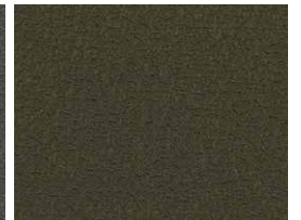
Burnished Slate SRI 28 • 18043