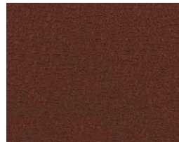
Apache SRI 27 • 17882

Rawhide offers both a modern color palette and proven product performance to make it ideal for any project. Rawhide won’t collect dirt and grow mold and is supported by a robust 30 year finish warranty. For additional protection, Rawhide is available over ZINCALUME® steel which offers superior corrosion performance and a 25 and a half year corrosion warranty.