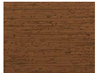
Timeless Copper SRI 43 • XBRUCO01