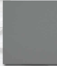
SHALE 24136 SRI: 41 LRV: 23 GLOSS: 3-6 SHEEN: 3-9