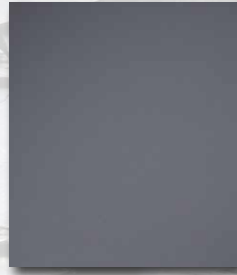
BASALT 23157 SRI: 31 LRV: 13 GLOSS: 3-6 SHEEN: 3-9