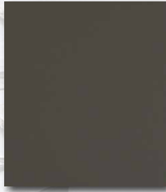
ORE 24074 SRI: 27 LRV: 8 GLOSS: 3-6 SHEEN: 3-9