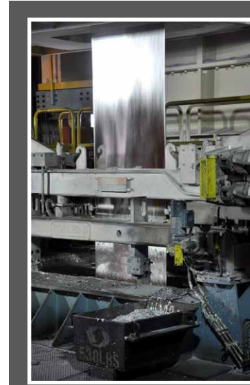
Application of the Metallic Coating at Steelscape Kalama

The metallic coating is applied to the bare steel before it is painted. In most instances, the metallic coating is applied by passing the steel through a molten pot of the coating, after which it is cooled and treated to create a tightly bonded, consistent finish. This process is performed in accordance with ASTM standards A924, A653 and A792.